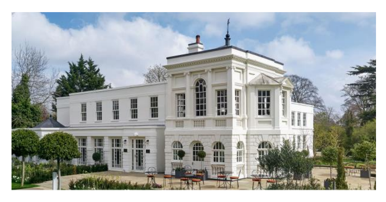
See Bray from the air in this video

A little further downstream is <u>Monkey Island</u>, once owned by the Duke of Marlborough but now a small luxury hotel