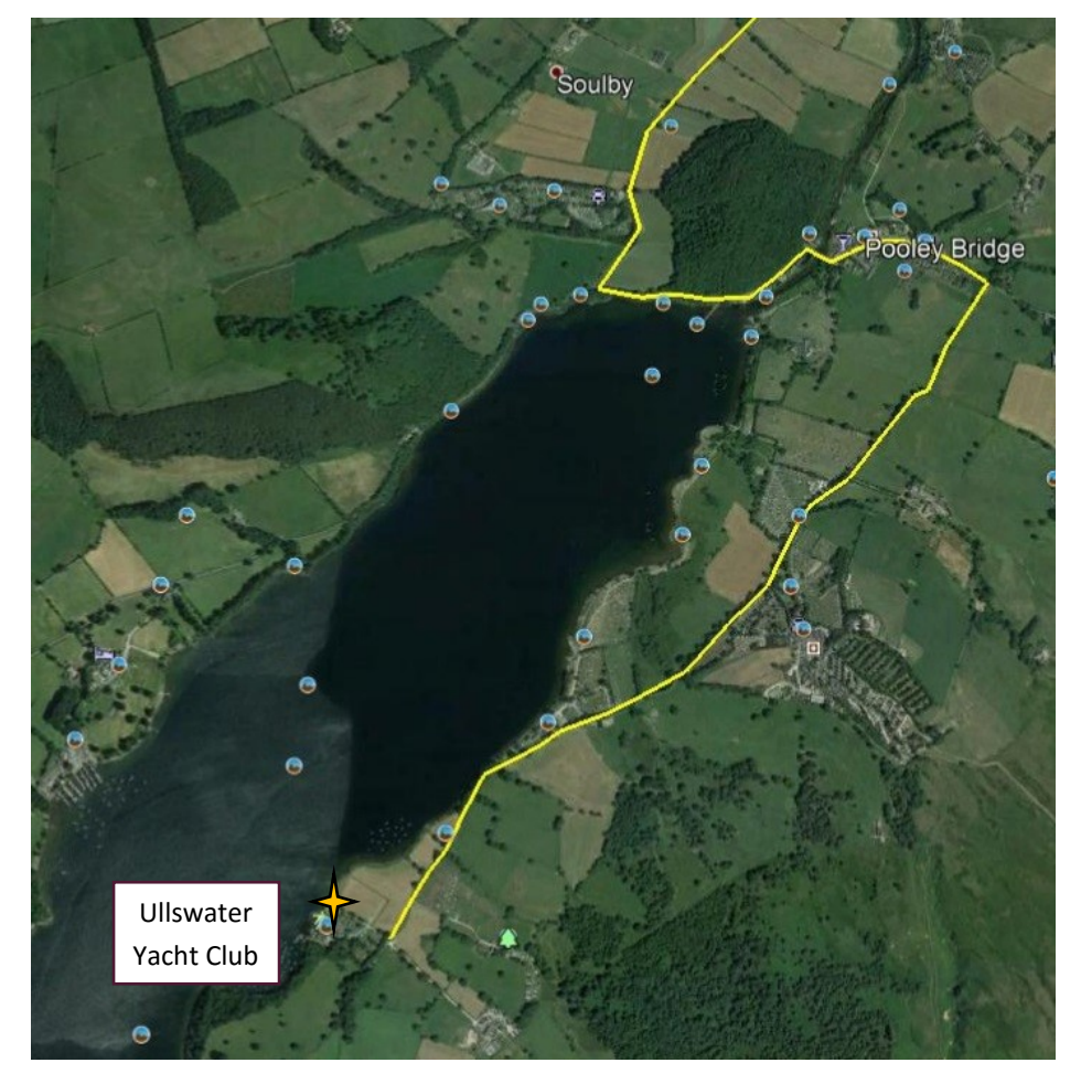
Ullswater — Ullswater Yacht Club Thwaite Hill, Howtown, Penrith CA10 2NA Tel 07704